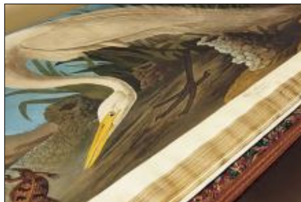
Illustration from AUDUBON

the 175 to 200 complete sets of plates still exist today.