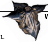
Water chestnut seed