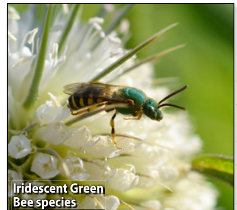
Iridescent Green Bee species

How you can help: In your garden choose locally native perennials of yellow, blue or purple flowers that bloom at different times. Plant herbs, such as basil, cilantro, thyme, oregano and borage in your vegetable beds and let some go to flower for the bees. Bees drink water as well as nectar, so a water feature would be helpful. Reduce mulching, mowing and tilling that may destroy nests or future nesting sites. Avoid using insecticides (which kill bees directly) and herbicides (which kill the plants bees depend on). Steer clear of systemic insecticides. Help scientists learn more about the insects by reporting bees you see in your garden to the citizen-science project www.BumbleBeeWatch.org .