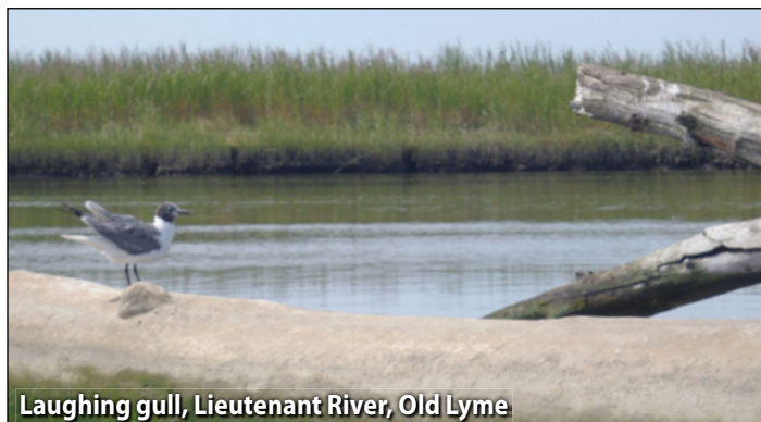
Laughing gull, Lieutenant River, Old Lyme

Bring canoe or kayak, lunch, and supplies for a day on the water (bathing suit optional). Meet at 8:00 a.m. at Lieutenant River boat launch site on Rt. 156, Old Lyme. Call Larry Cyrulik for details 860-342-4785 or 860-635-1880.