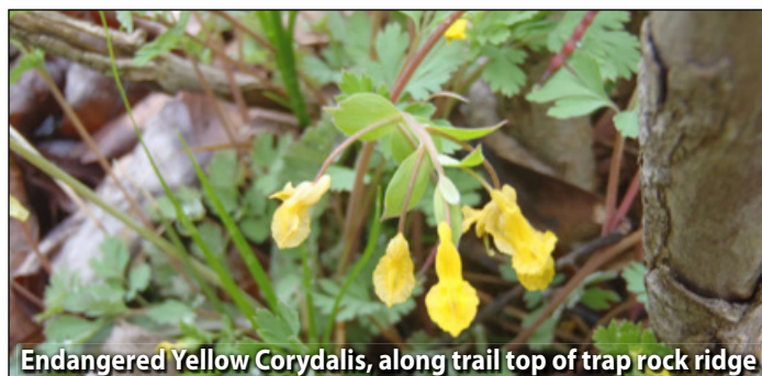
Endangered Yellow Corydalis, along trail top of trap rock ridge