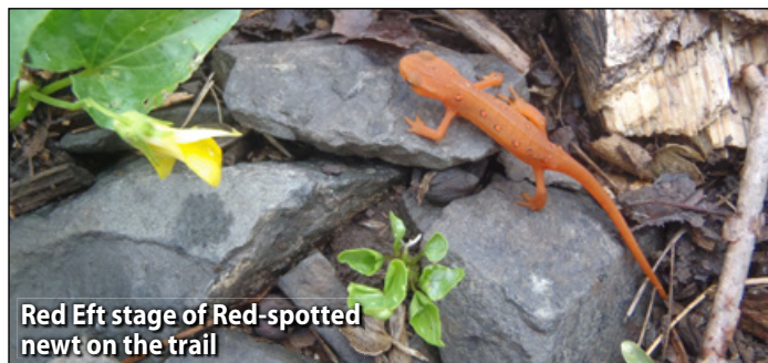
Red Eft stage of Red-spotted newt on the trail

Climbing now, but as if on wings of anticipation, past fields of white rue anemone, suddenly a kaleidoscope of orange movement, animated petals of a different sort: red eft, the terrestrial stage of the red-spotted newt starting along the way. Watch your footfalls!