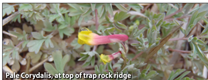
Pale Corydalis, at top of trap rock ridge

4 participants; 23 flower and flowering tree-shrub species; 22 avian species