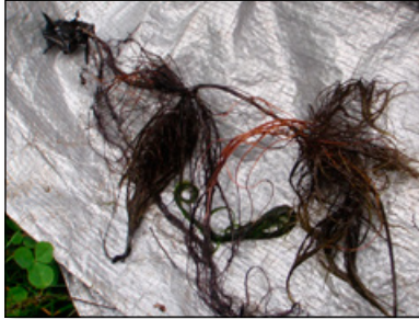
Water chestnut roots break easily. If pulling, use many slow, very light tugs to liquefy mud around roots. The seed's barbs can pierce skin.